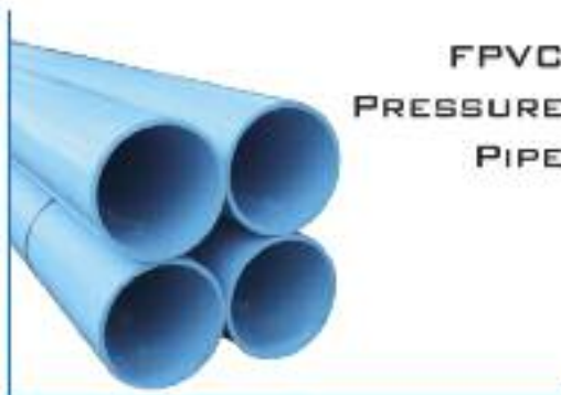
FPVC PRESSURE PIPE