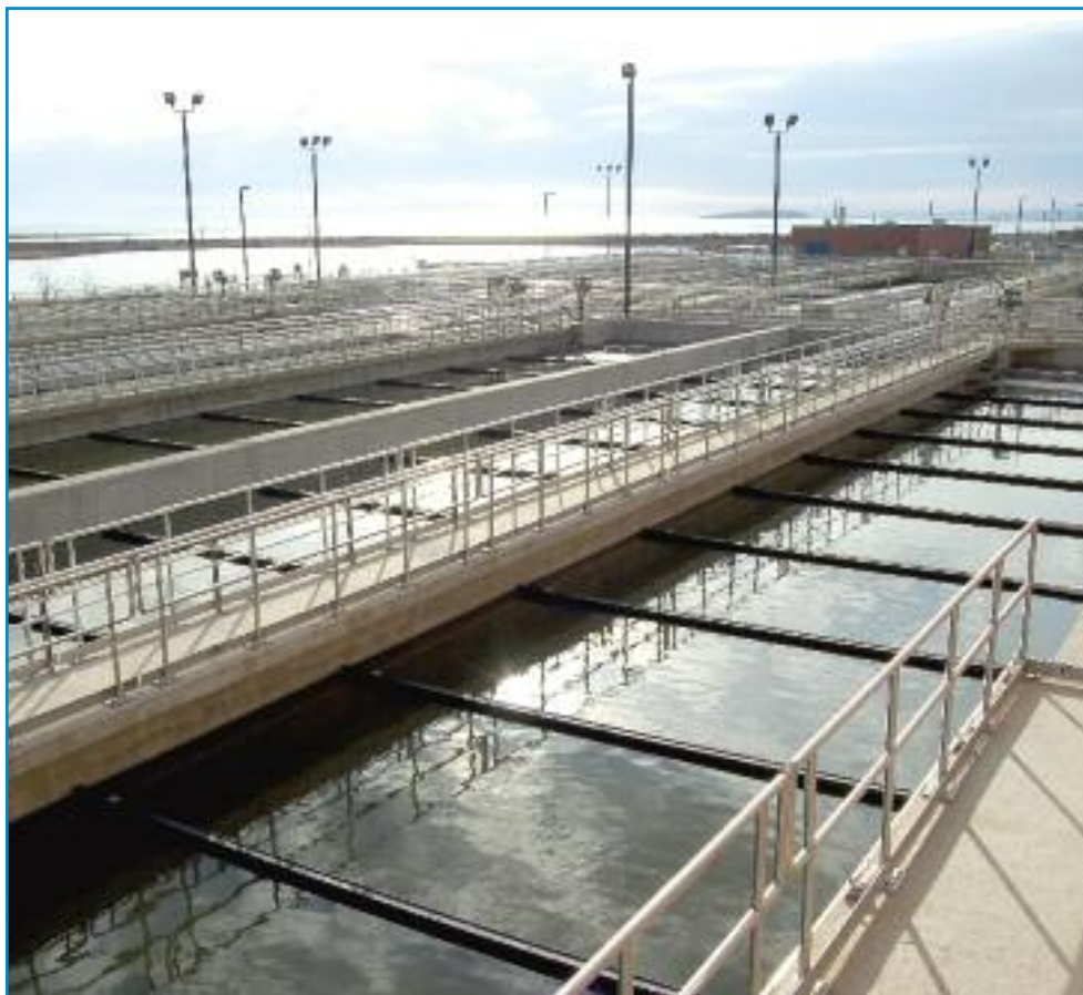
The primary clarifiers at the Eastern Wastewater Treatment Facility.

The federal, provincial and municipal governments have each contributed $26.6 million to the Saint John Harbour Clean-Up initiative with the City contributing the balance ($45.8m). The entire project is expected to cost just over $99 million.