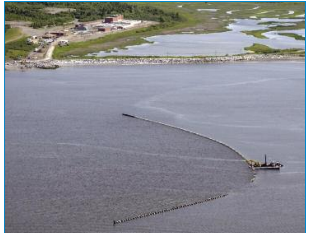
The outfall pipe for the Eastern Wastewater Treatment Facility is towed into place by a barge. The outfall extends 1.2 km into the Bay of Fundy and is submerged a minimum of 1 metre at low tide.