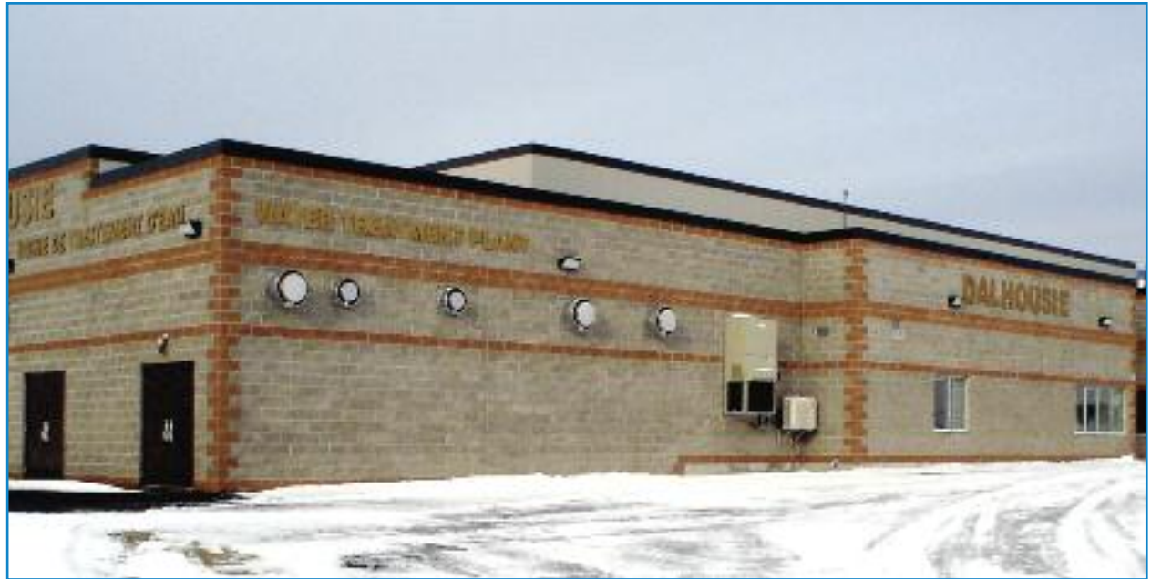
The Town of Dalhousie Water Treatment Plant will be named after Eddie Guitard.

But he's missed very few of the annual MPWWA Seminars. “I feel