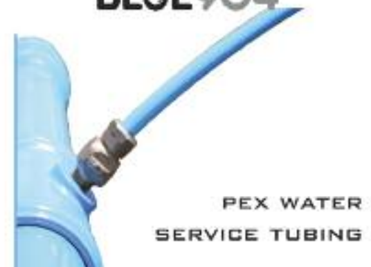
PEX WATER SERVICE TUBING