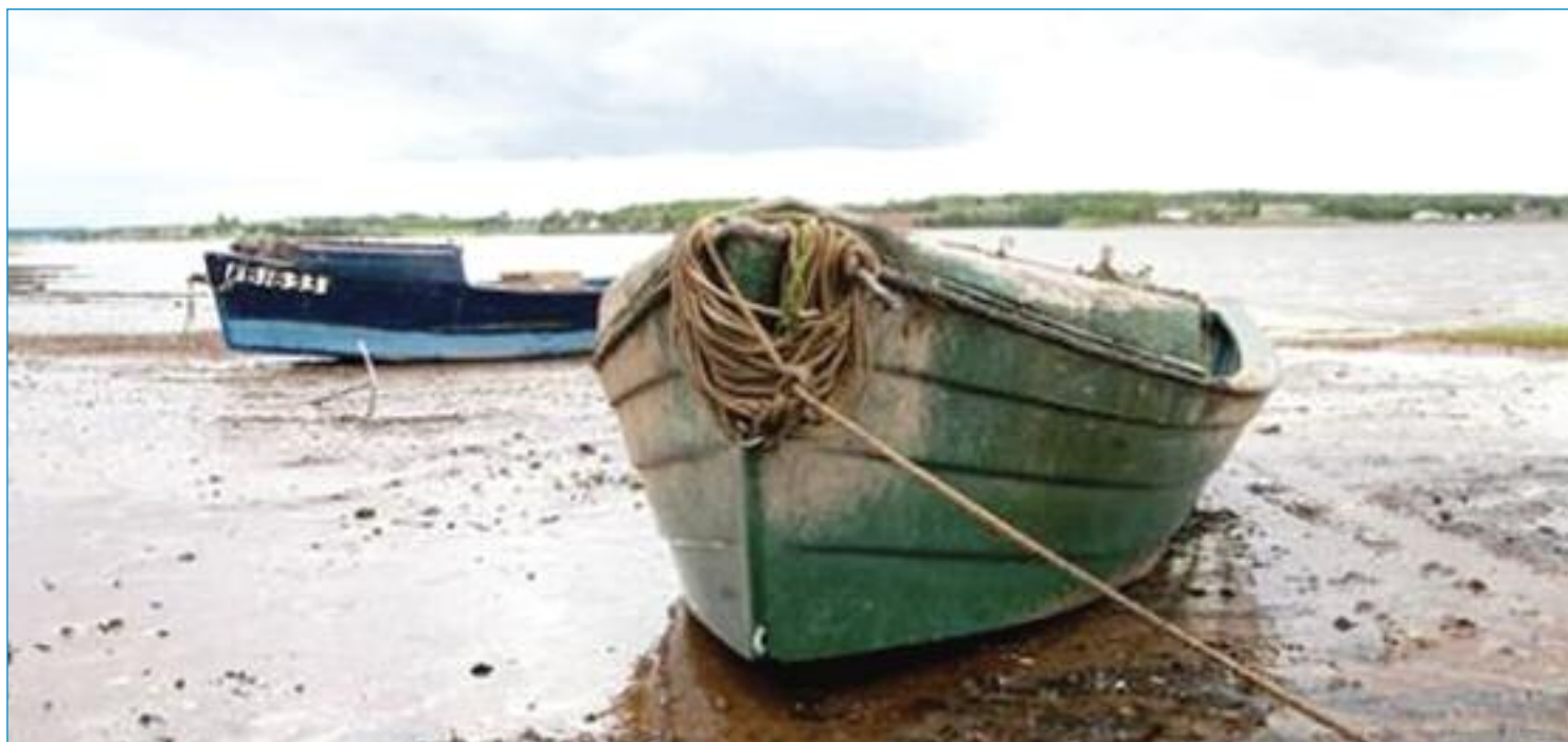
When storm water combined with sewage runs into Charlottetown Harbour, it causes the shellfishery to be closed down.

"I am confident Ottawa will announce its share of the funding soon," the mayor said. "I am hoping we will be able to put the project to tender in