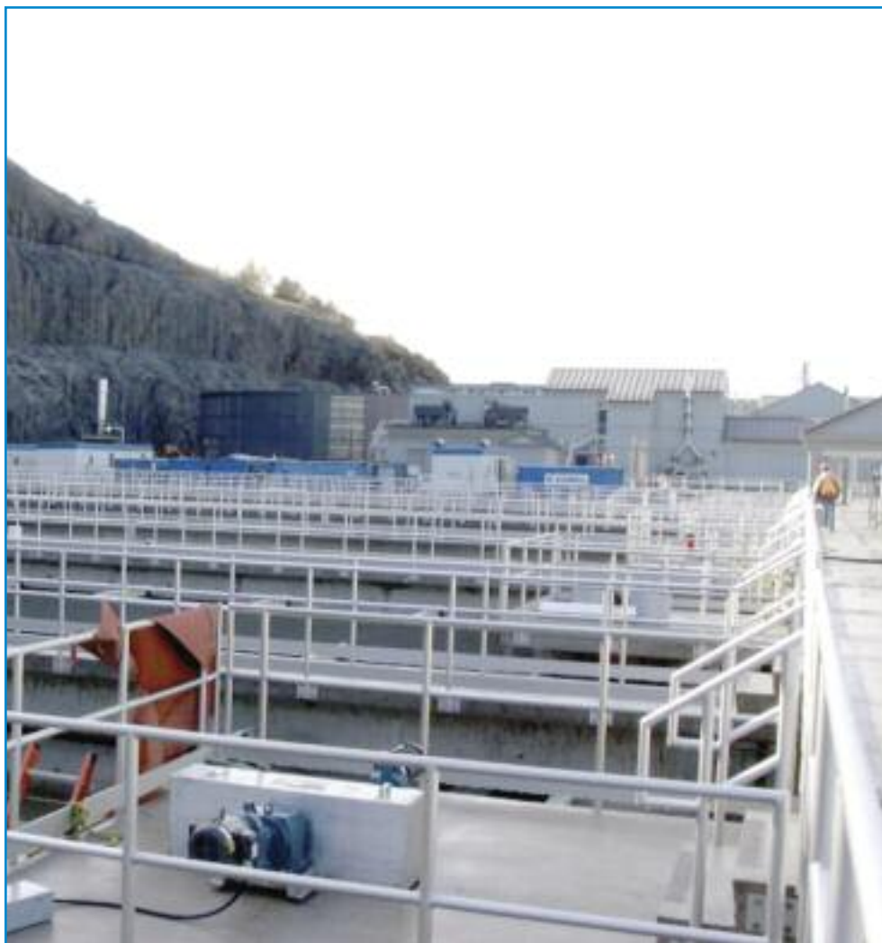
Repairs were to get underway in January on one of the two 7.5 million litre anaerobic digesters at the Riverhead Wastewater Treatment Facility that serves St. John's, Mount Pearl and Paradise, Newfoundland.