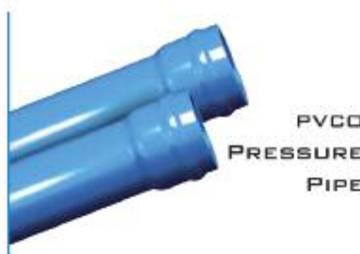
PVC PRESSURE PIPE