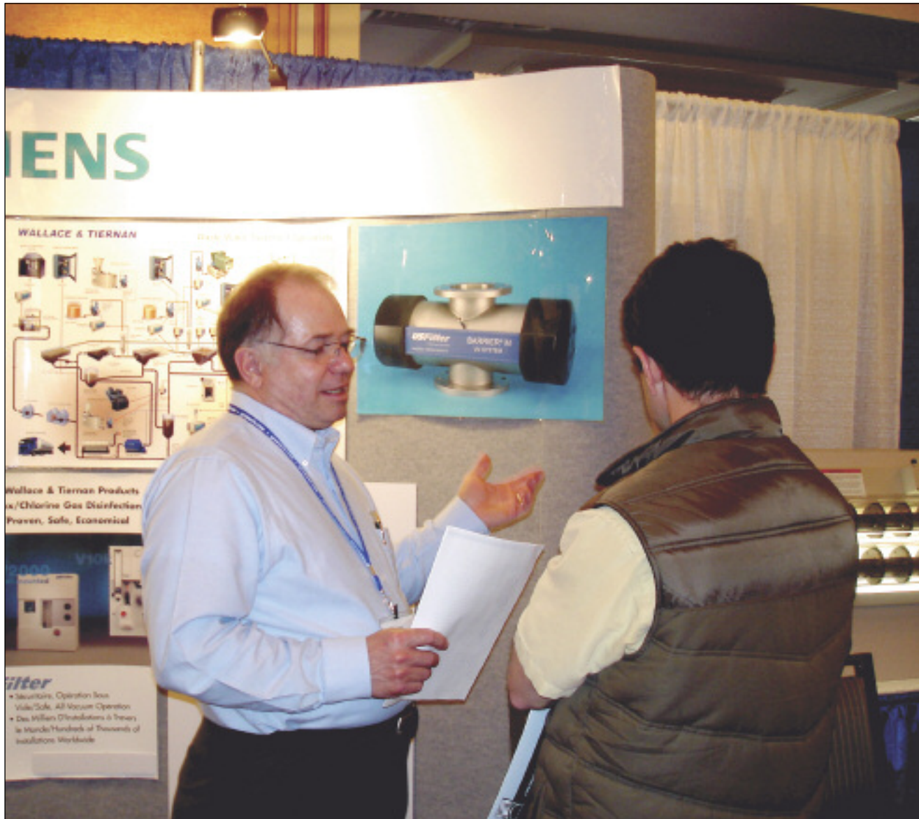
MPWWA members had an opportunity to view the latest technology and speak with industry leaders during the equipment display.