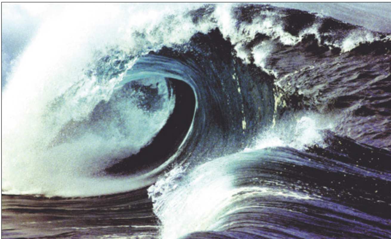
The International Desalination Association and Global Water Intelligence shined a spotlight on three technologies designed to reduce the cost of making drinking water from the sea.