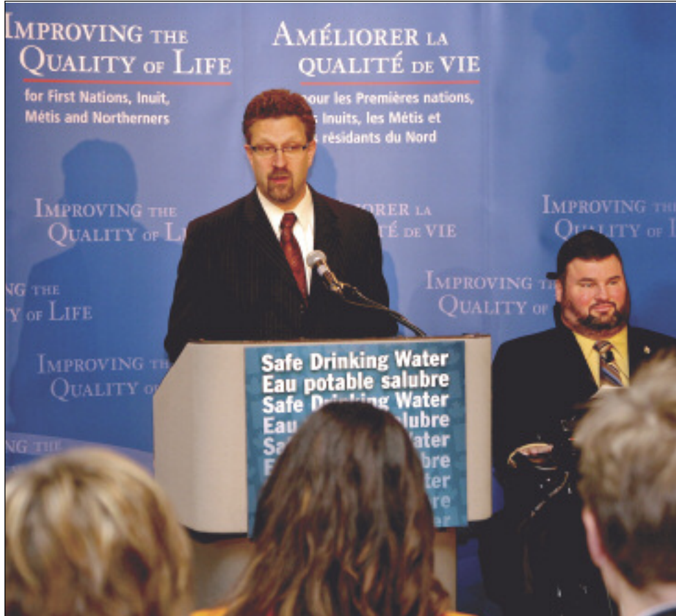
Chuck Strahl (Minister of Indian Affairs and Northern Development and Federal Interlocutor for Métis and Non-Status Indians) and Steven Fletcher (Parliamentary Secretary) recently announced a multi-million dollar investment in a First Nations Water and Wastewater Action Plan.