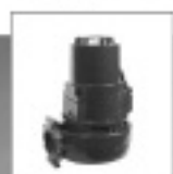
The Anvarac-KRT submersible motor pump for all kinds of waste water.

KSB Pumps Inc. • Mississauga, Ontario • E-mail: ksbcanada@ksbcanada.com Tel. (905) 568-9200 • www.ksb.ca