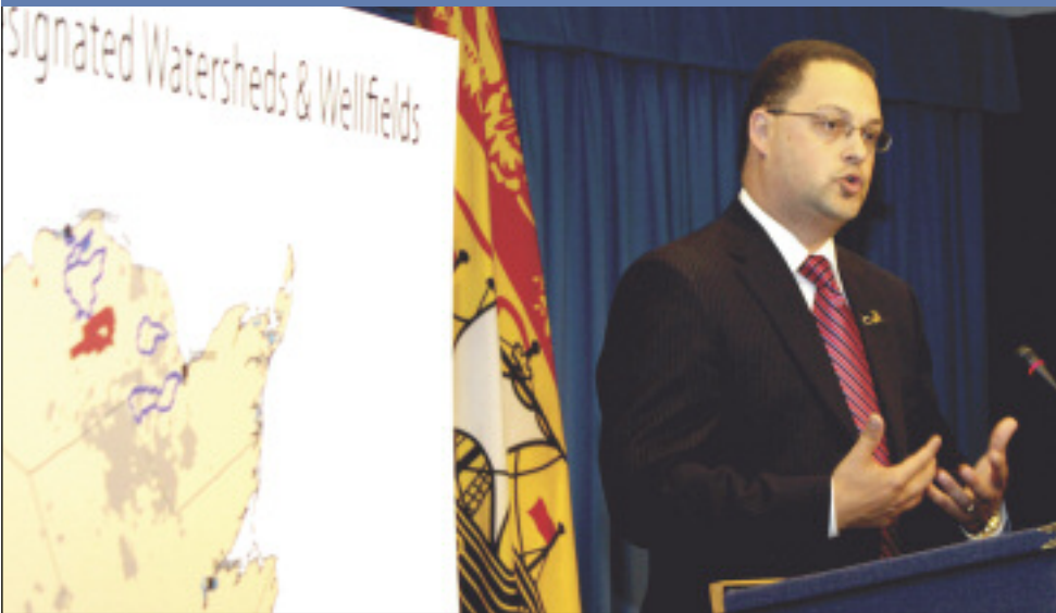
The new uranium exploration and mining regulations, announced by Natural Resources Minister Donald Arsenault (above) and Environment Minister Roland Haché, better protect drinking water supplies.