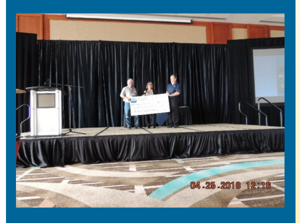
Cheque presentation to Brain Injury Association of PEI Charlottetown, PEI, 2018