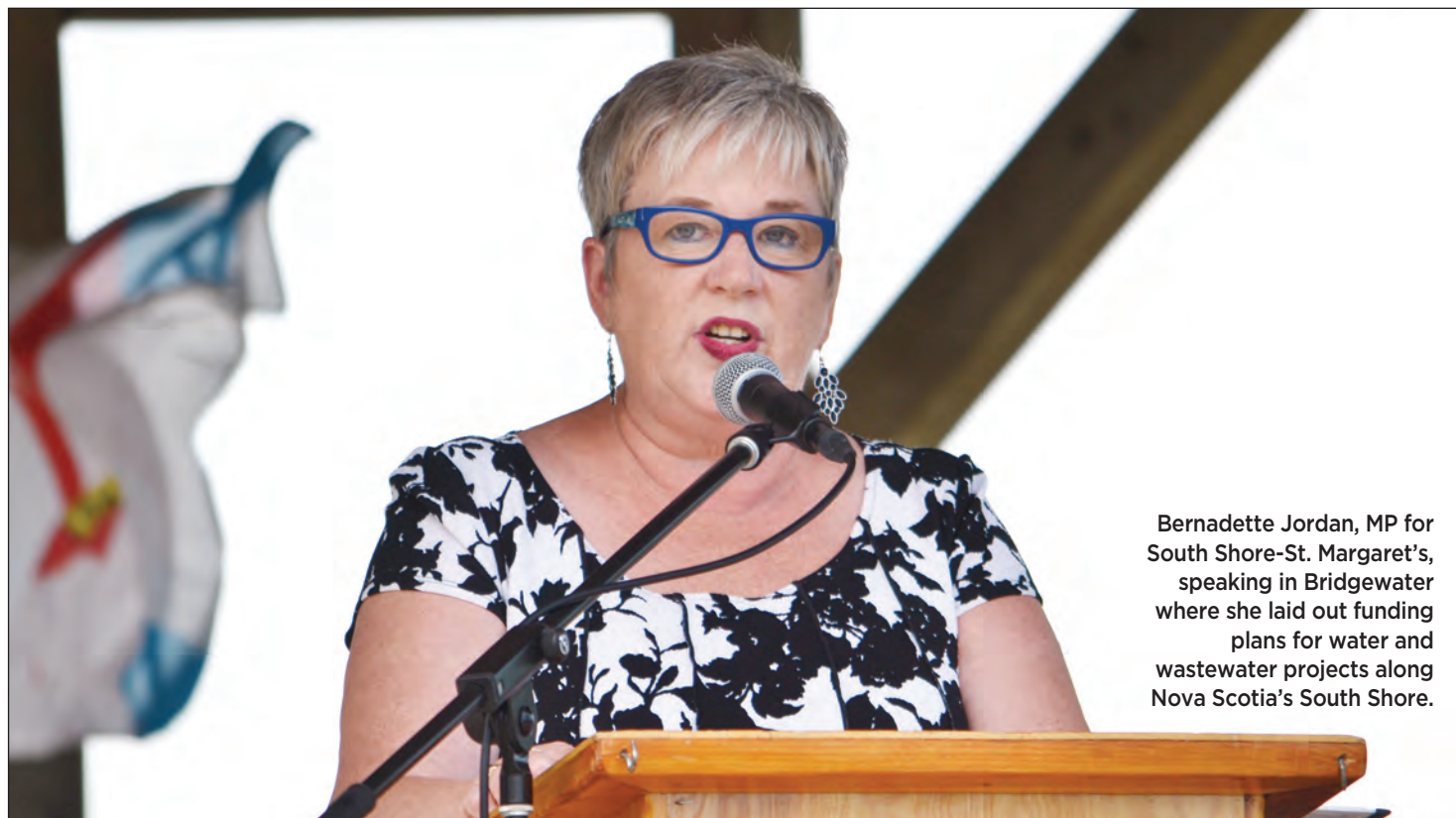
Bernadette Jordan, MP for South Shore-St. Margaret's, speaking in Bridgewater where she laid out funding plans for water and wastewater projects along Nova Scotia's South Shore.